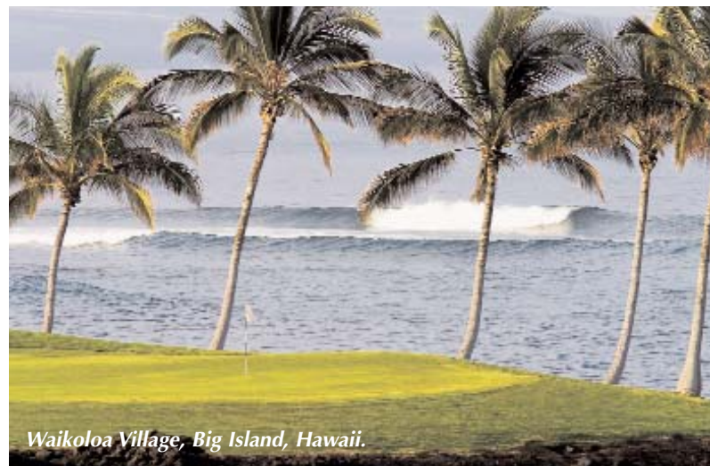
Waikoloa Village, Big Island, Hawaii.