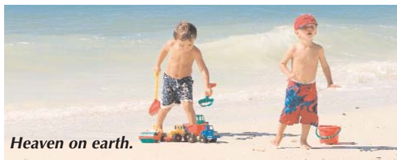
Heaven on earth.