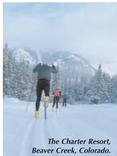
The Charter Resort, Beaver Creek, Colorado.

amenities and benefits including personal onsite concierge service to look after any and all of his families personal needs or requests.