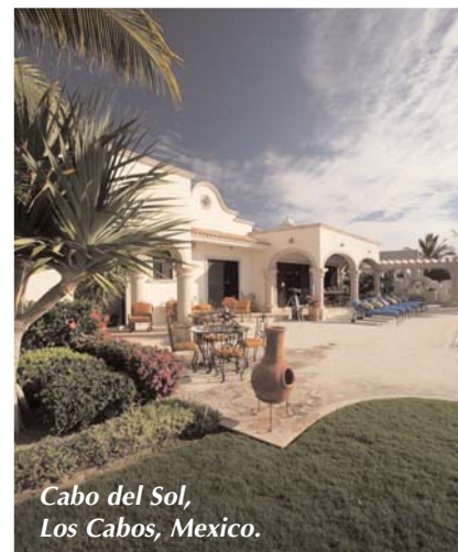
Cabo del Sol, Los Cabos, Mexico.