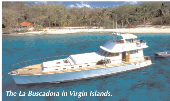
The La Buscadora in Virgin Islands.