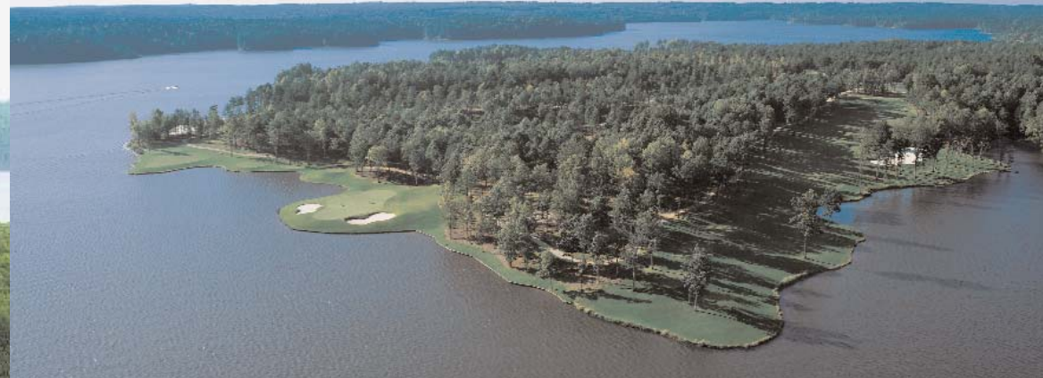
Jack Nicklaus Great Waters Course.