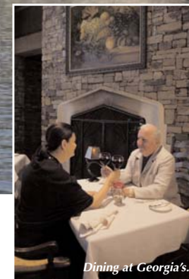
Dining at Georgia's.