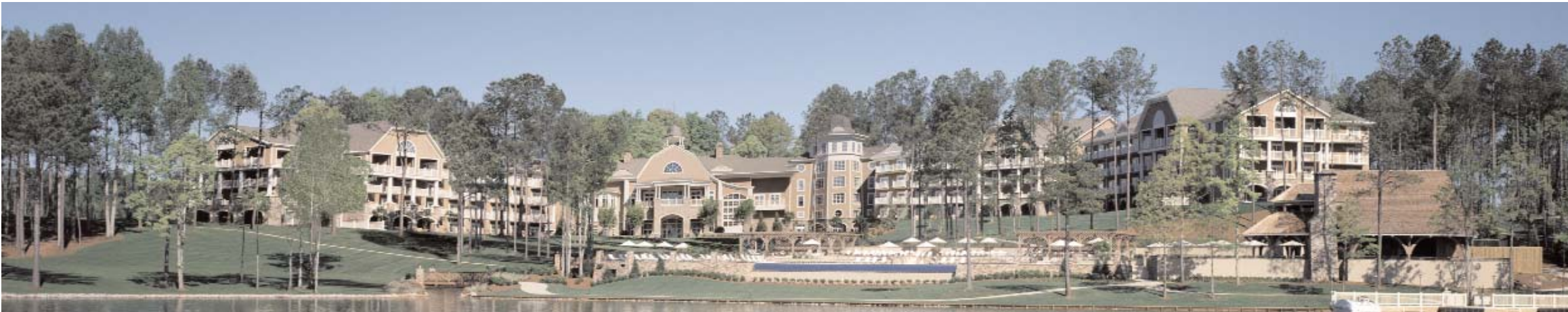
The Ritz-Carlton Lodge, Reynolds Plantation.