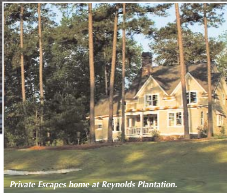
Private Escapes home at Reynolds Plantation.