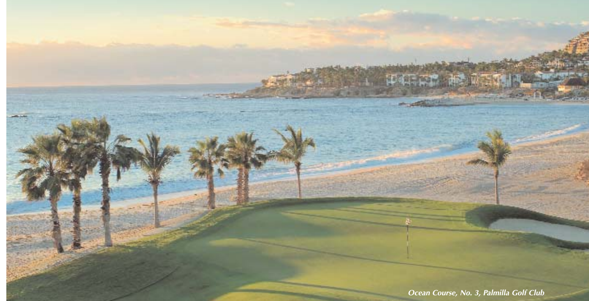
Ocean Course, No. 3, Palmilla Golf Club

NFL Hall of Famer and former San Francisco 49ers quarterback Steve Young, a Platinum member who joined for family reasons, said: "My family and I chose