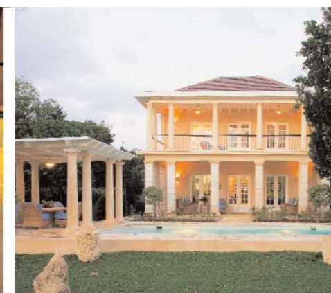
2 PuntaCana Resort e 2 Club in the Dominican Republic