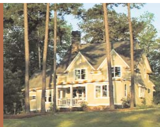
1 Reynolds Plantation, Greensboro, Georgia