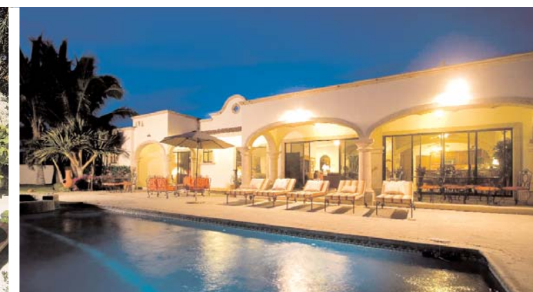
3 Our magnificent home in Cabo del Sol, Los Cabos, Mexico